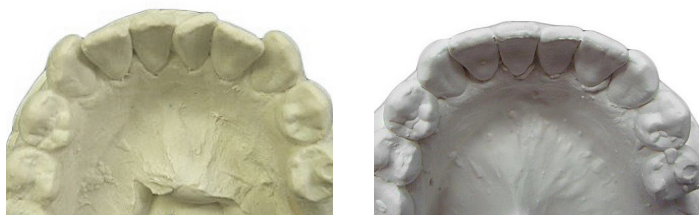
Lower anterior crowding treated to this point with 4 aligners and moderate IPR. One aligner “refinement” planned to complete correction of rotations.