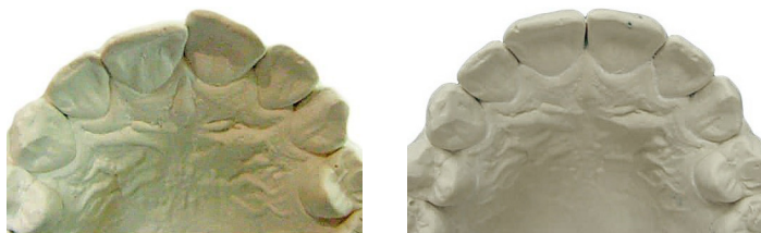
Upper anterior crowding treated with 4 aligners. Example of how aligners correct rotations with minor IPR.