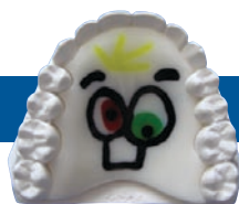
H04 Crazy Eyes