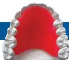
D01 Hot Pink