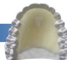
E06 Moon Glow