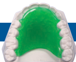
D02 Lime Green