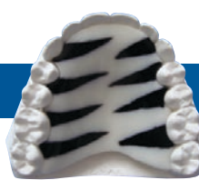
F04 Zebra Stripes