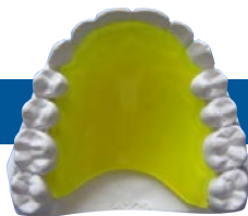
D03 Lemon Yellow