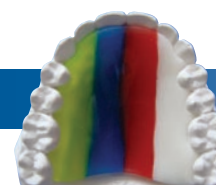
H08 Rainbow Choose any 4 Colors