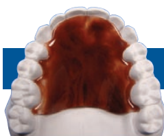
F01 Desert Camouflage