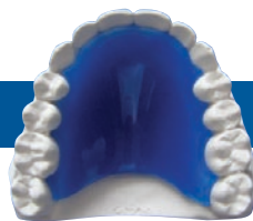
D04 Sky Blue