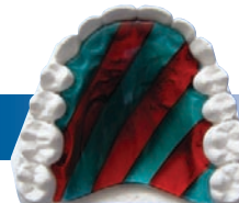
G04 Stripes Choose any 2 Colors

For information on available decals, please contact Customer Service at 1.800.LAB.INFO (1.800.522.4636) or visit our website at www.specialtyappliances.com .