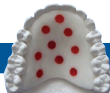
G02 Polka Dots Choose 2 colors from Opaque colors