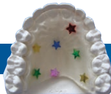
G03 Star Brite Choose 1 Specialty color