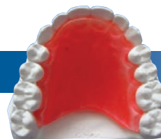
D05 Lava Red