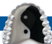
H02 Yin Yang