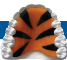
F03 Tiger Stripes