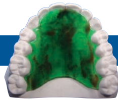
F02 Jungle Camouflage