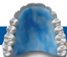
G01 Marbled Choose 1 color from Laser Lights